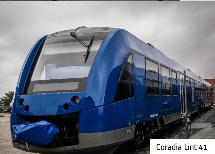
Coradia Lint 41