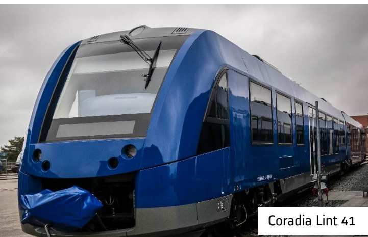
Coradia Lint 41