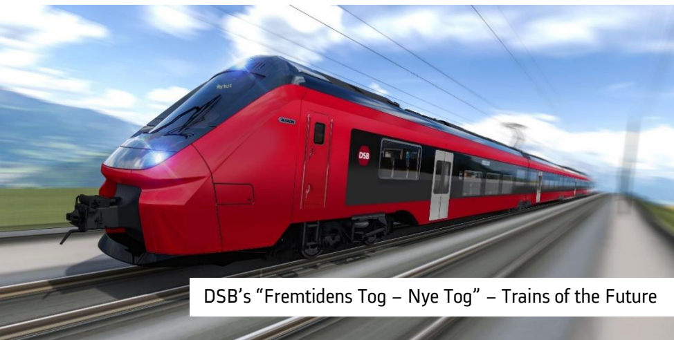
DSB's "Fremtidens Tog – Nye Tog" – Trains of the Future