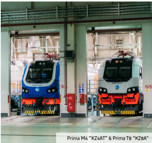
Prima M4 "KZ4AT" & Prima T8 "KZ8A"

Alstom is present in Kazakhstan since 2010 with more than 1000 employees and after 10 years of continuous development, it now has 8 sites throughout the country: two plants: EKZ in Astana for electric locomotives production and maintenance and JV KazElectroPrivod (KEP) in Almaty for the production of point machines; three service depots, one repairing center, bogie services center and one administrative office. Alstom is the only manufacturer of electric locomotives and point machines in the Central Asian and Caucasian region and a major contributor to the revitalisation of its rail industry and the development of its economy.