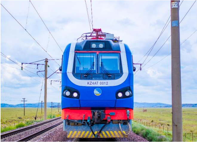
119 KZ4AT single section passenger locomotive