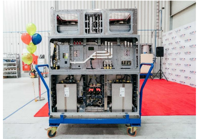
Traction System Converters State-of-the-art technology, reliability and efficiency for all rolling stock