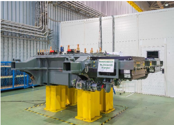
Onboard transformers with a full range of power ratings from 2 to 10 MVA