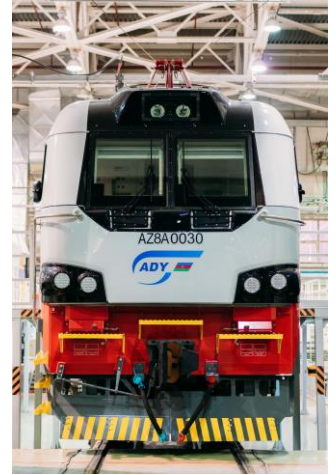
250 KZ8A & 40 AZ8A (exported to Azerbaijan) double section freight locomotives